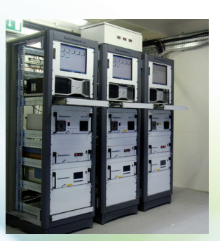
MIR FT rack cabinet