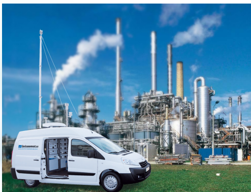
Example of turnkey mobile air quality monitoring station manufactured by ENVEA